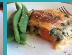
Images of actual meals, thawed, heated and plated

0800 328 333 orders@eat.co.nz www.eat.co.nz